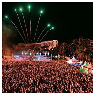
Siloso Beach Party ( http://www.timeout.com/singapore/things-to-do/siloso-beach-party )