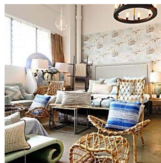
Tan Boon Liat Block Party ( http://www.timeout.com/singapore/things-to-do/tan-boon-liat-block-party )