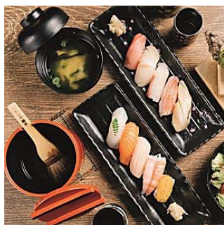
Koji Sushi Bar ( http://www.timeout.com/singapore/things-to-do/koji-sushi-bar )