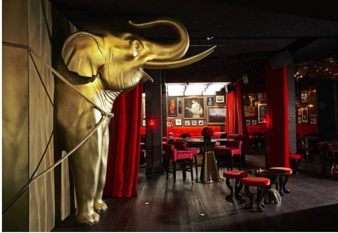
An elephant sculpture looks over the Hotel Vagabond's salon.

tasselled chairs on leopard-print carpet. And that's just the public space! The glamorous but less theatrical rooms have dark mahogany furniture, hand-painted screens and walls lined with exotic travel photos. All in all, a perfect mise en scène for a hotel that motto tells its guests: "If you must get into trouble, do it at the Vagabond!"