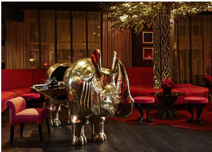
Guests are greeted by a life-size, brass rhinoceros-as-reception desk.

Or, stroll a few minutes from the hotel in the other direction to reach Kampong Glam, the traditional Muslim quarter. Here, the mood is set by the scent of frangipani in the Sultan's Palace garden and the sound of powerful daily calls to prayer from the gold-domed Sultan Mosque. In the enclave's narrow streets lined with traditional shop-house architecture, all things heritage and hip are on display.