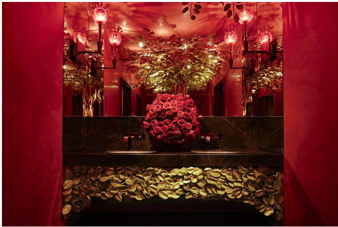
The lobby bathroom of the Hotel Vagabond.