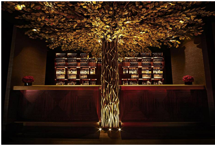
A banyan tree sculpture over the bar at the Hotel Vagabond.