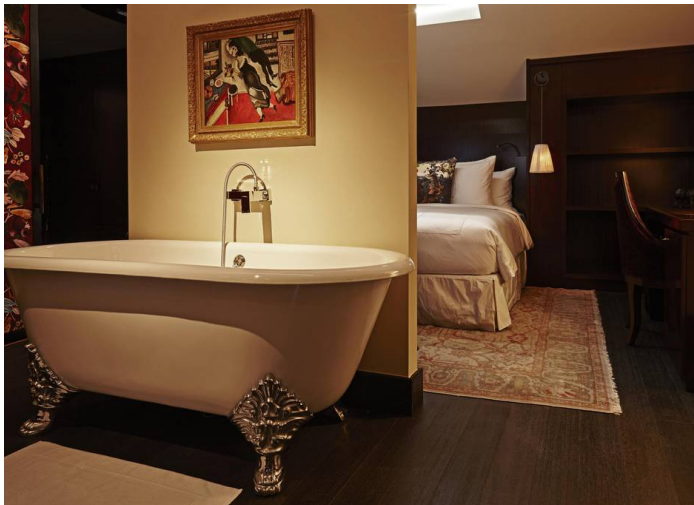
The Vagabond suite.