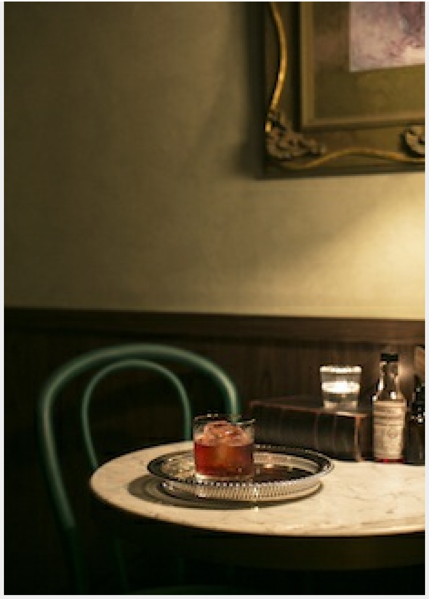
Say Hello to Bukit Pasoh's New Cocktail and Seafood Bar - ...