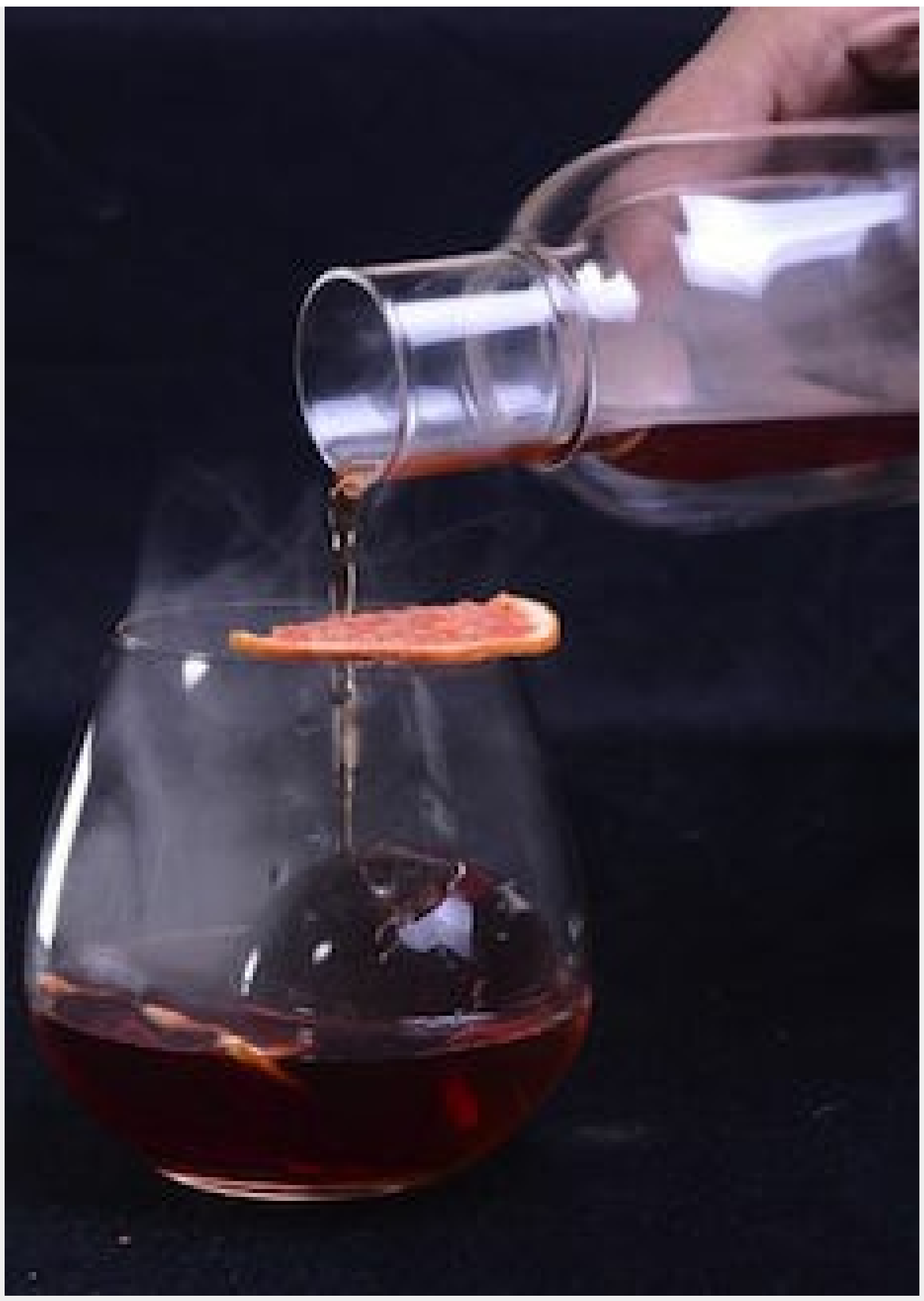
The Weekly Grub: 16 September 2015 Written on Wednesday, 16th September 15 by Joel Conceicao

From an absolute bargain on champagne deal to an all-new cocktail menu at ME@OUE, this week's edition of The Weekly Grub gives you the lowdown on the latest