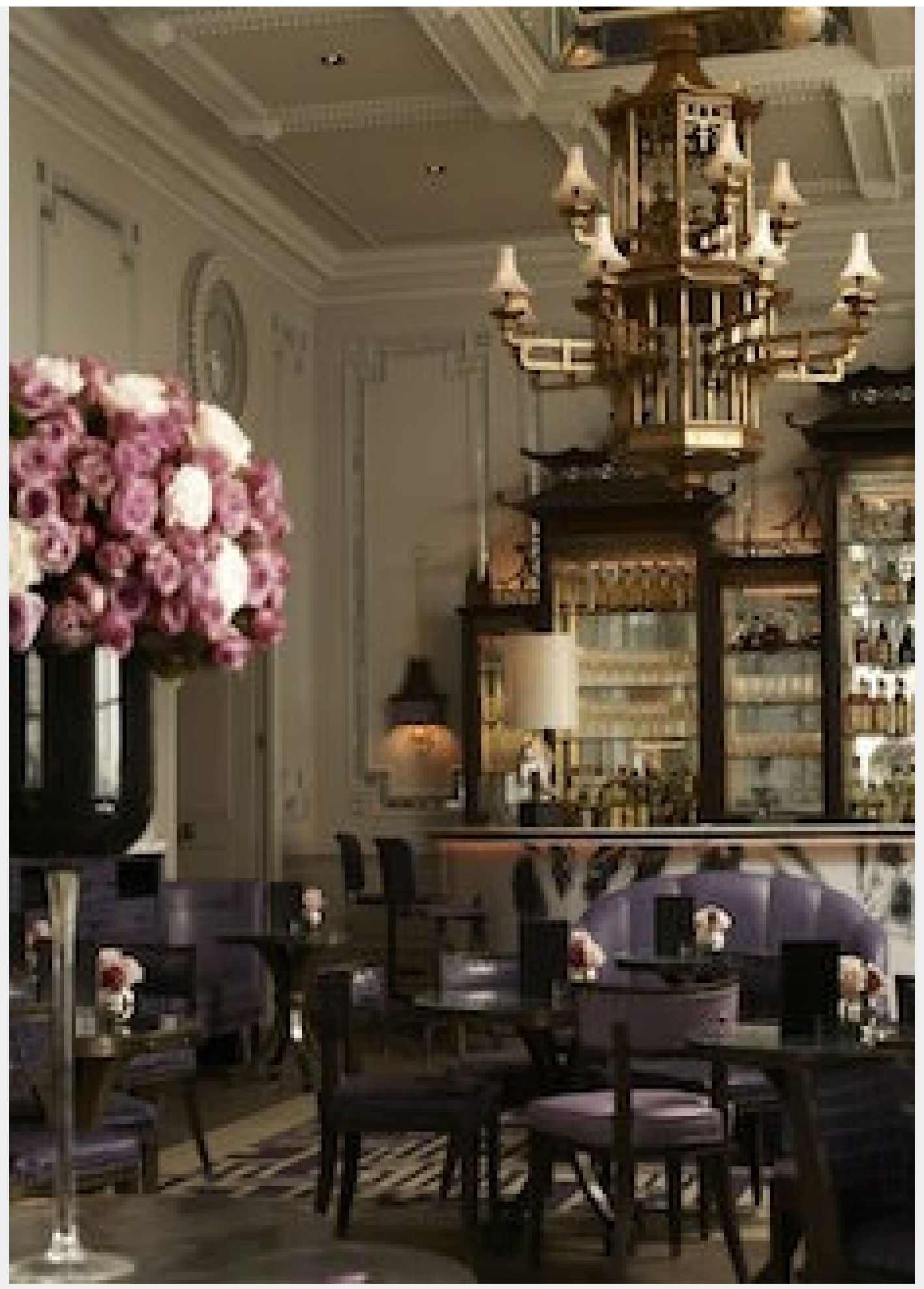
Two Singaporean Bars Make The World's 50 Best Bars 2015 Written on Friday, 09th October 15 by Errily Seow

SG50 might be over, but there's more than enough #sgpride to go around with the announcement of the 2015 edition of The World's 50 Best Bars in London last