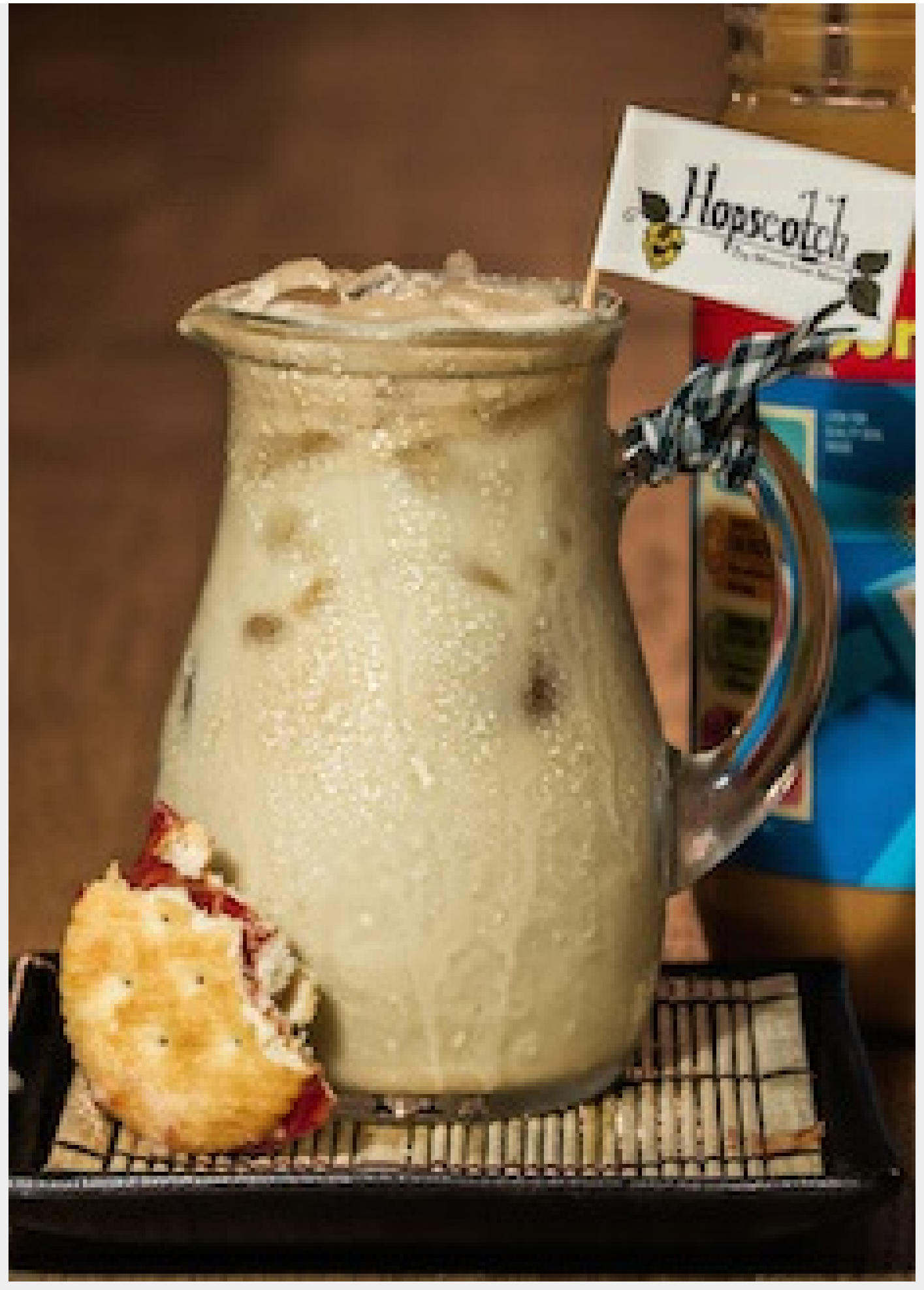
Locally Inspired Cocktails at Hopscotch: Review Written on Monday, 21st September 15 by Emily Seow

If you love drinks with a local touch, you'll find yourself perfectly at home at Hopscotch. Hidden within the confines of Red Dot Traffic Building, this cocktail bar by