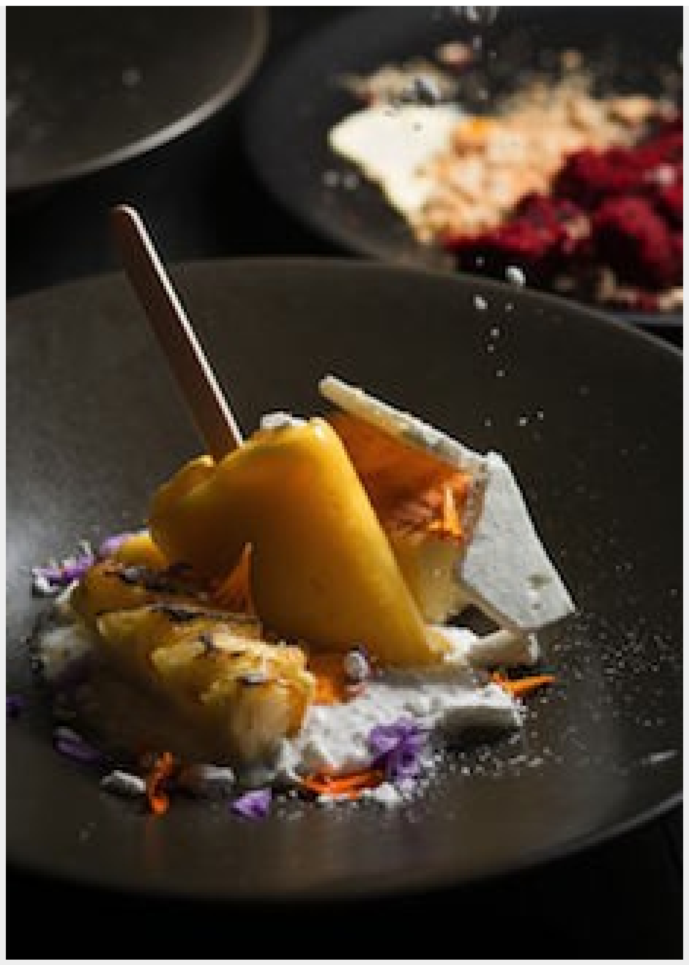
Raven Restaurant & Bar - Taste The New Americas at CHIJMES: ...